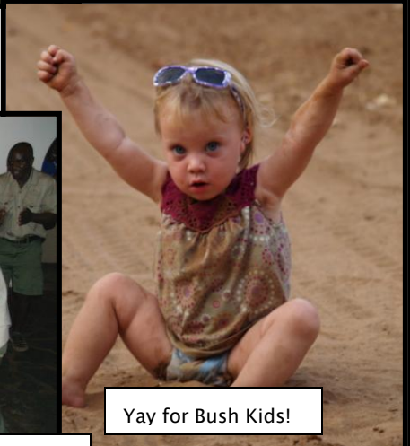
Yay for Bush Kids!