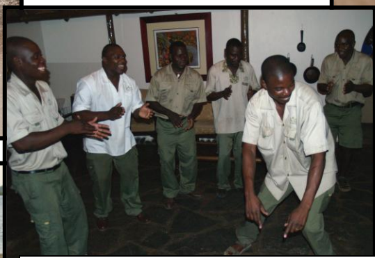
And a round of applause for our wonderful staff!